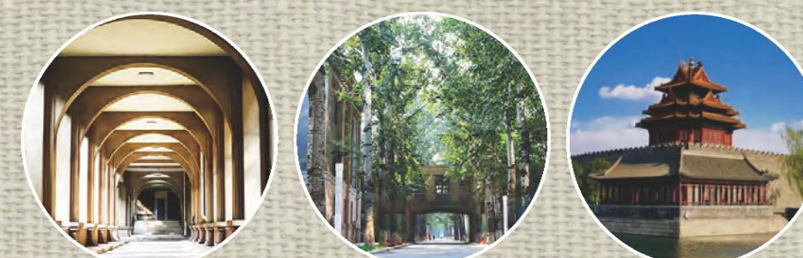
Timetable of ISS 2019